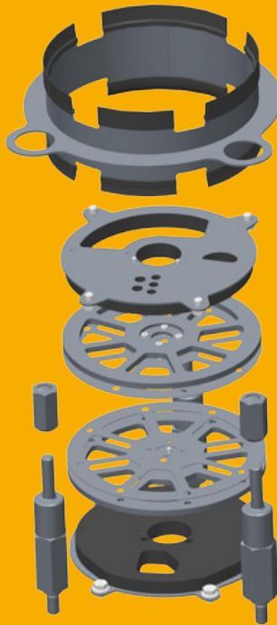
Accessory kit for sealing plates