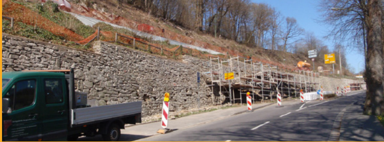
Joint refurbishment over approx. 5000 m 2 , Construction company Ehringsdorfer, in Monschau / Eifel, Germany

Whether you have to work on small concrete refurbishments or seal joints, with the Aliva ® Rotor Repro and the Aliva ® Converto Repro nozzle, you will always achieve proper working results. Convert your Aliva ® -237 rotary machine quickly and very easily with our Aliva ® Rotor Repro conversion kits to a mini-“refurbishment system”.