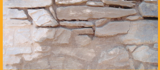
Very proper working results: Exact joint filling